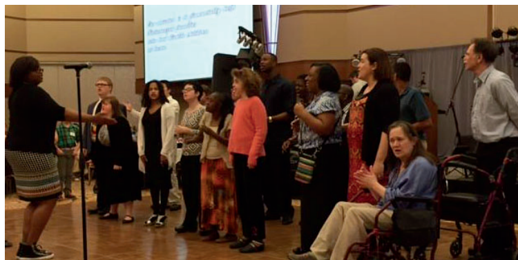
Community Voices performs in 2016

Our impact is being felt in the Kalamazoo arts community and beyond as we continue to grow. On-site enrollment reached 555. Across all programs we reached over 1,250 children and adults with the number of contact/teaching hours totaling over 24,430! Students and instructors prepared and presented music at over 40 public events reaching an audience of over 4,000. The Marvelous Music! program, developed by Crescendo and the Kalamazoo Symphony Orchestra, provided Music Together Preschool to over 720 area children with high financial need in Kalamazoo County.